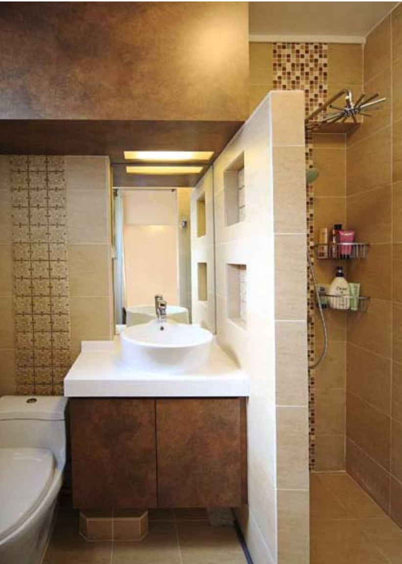
ABOVE LEFT Tiles provide a graphic and tactile element in the master bathroom. ABOVE Calming neutrals set the atmosphere for sleep in the bedroom.

OUR HOMEOWNERS APPRECIATE THAT WE PROVIDE WELL-DESIGNED HOMES AT REASONABLE PRICES.