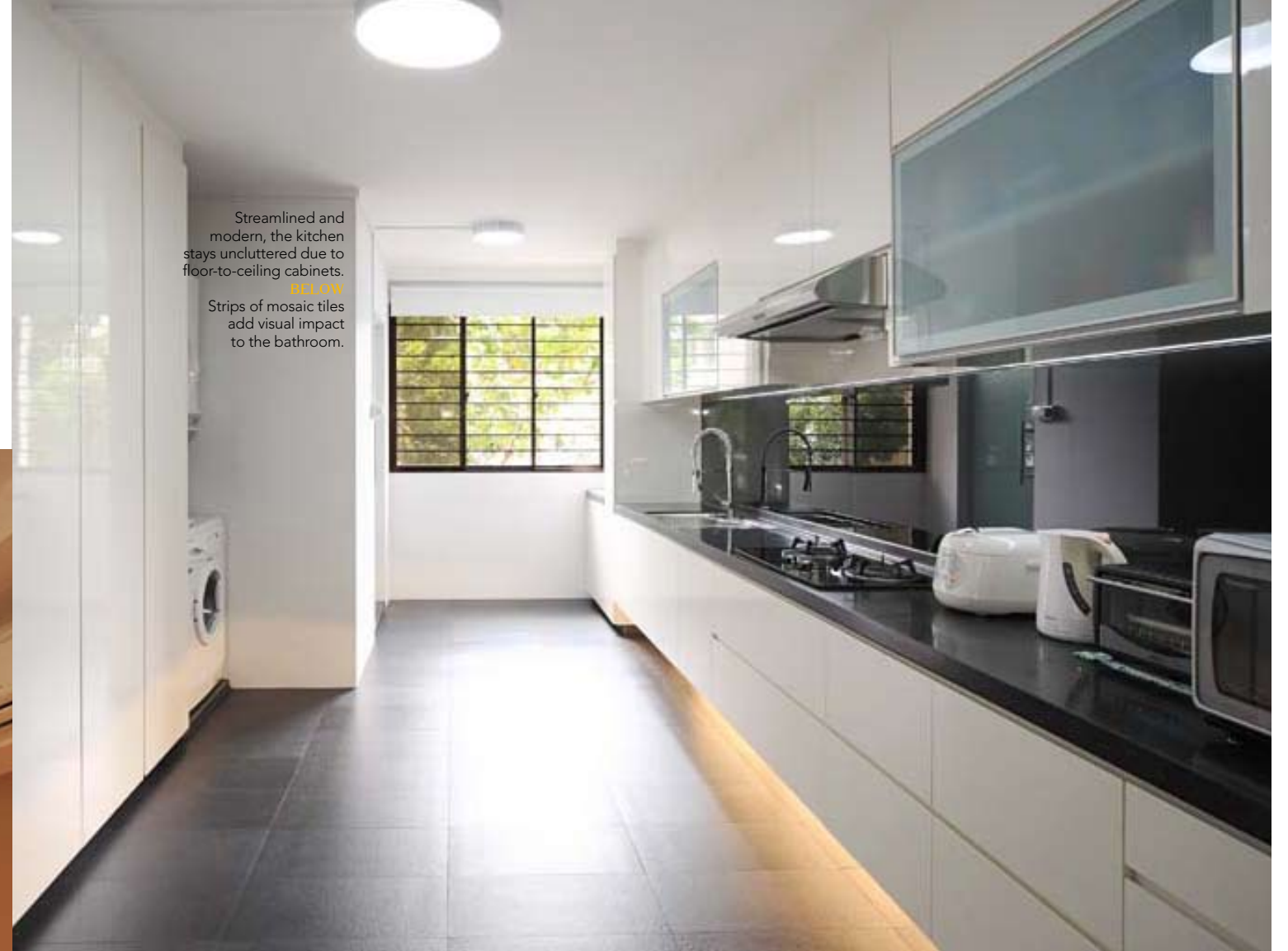
Streamlined and modern, the kitchen stays uncluttered due to floor-to-ceiling cabinets. RIGHT Strips of mosaic tiles add visual impact to the bathroom.